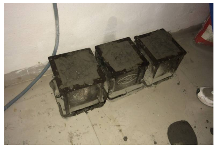
(b)This is the image of the above prepared concrete mixes in the cubical moulds

The same procedure shall be followed for the cube specimens with 5% and 10% crushed glass in the concrete mix.